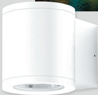
SSUD510F Single Up or down lighting