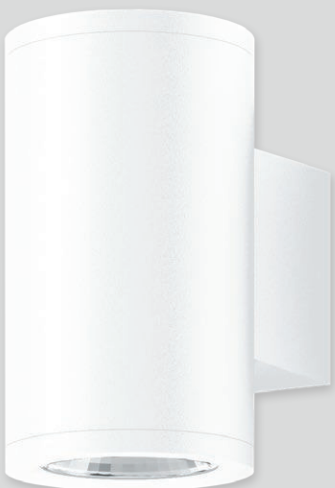
SSUD520F Double Up and down lighting