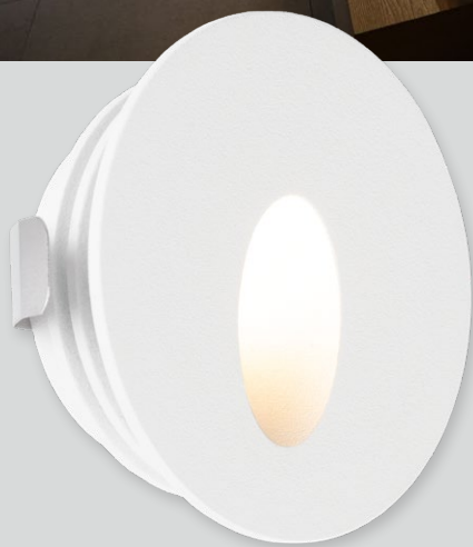
SSWS310 Stair / wall lighting