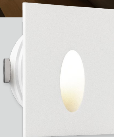
SSWS320 Stair / wall lighting