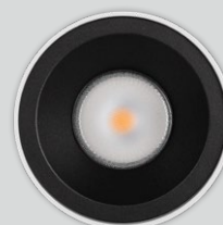
SLPN101F Prismatic diffuser Beam 40° 55° General | Task lighting