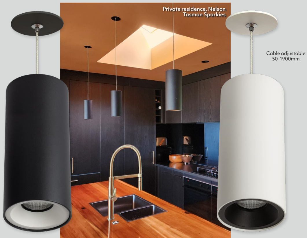
SLPN100F Beam 40° 55°