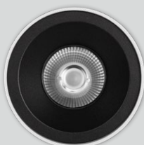
SLPN104F Lens Beam 9° 15° 20° Spot lighting