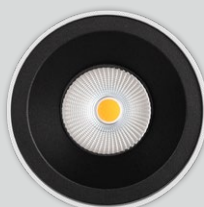
SLPN100F Clear glass Beam 40° 55° Task | General lighting