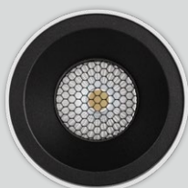
SLPN106F Honeycomb 30° 40° Anti-glare lighting