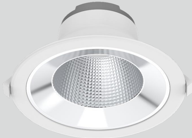
SLCD131F Ø190mm Commercial lighting