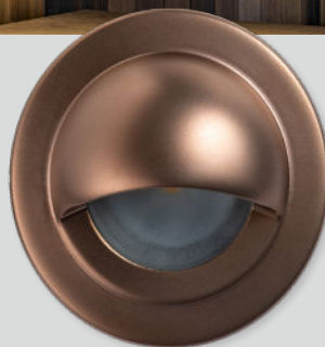
Eyelid Trim (Shown Actual Size)