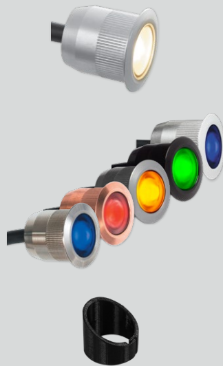
SLGL-GSB-25 Glare Shield accessory