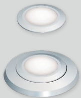
Natural Anodised Aluminium