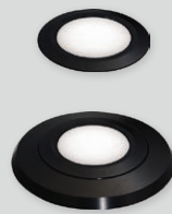
Black Anodised Aluminium