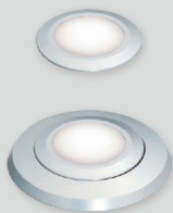
Natural Anodised Aluminium