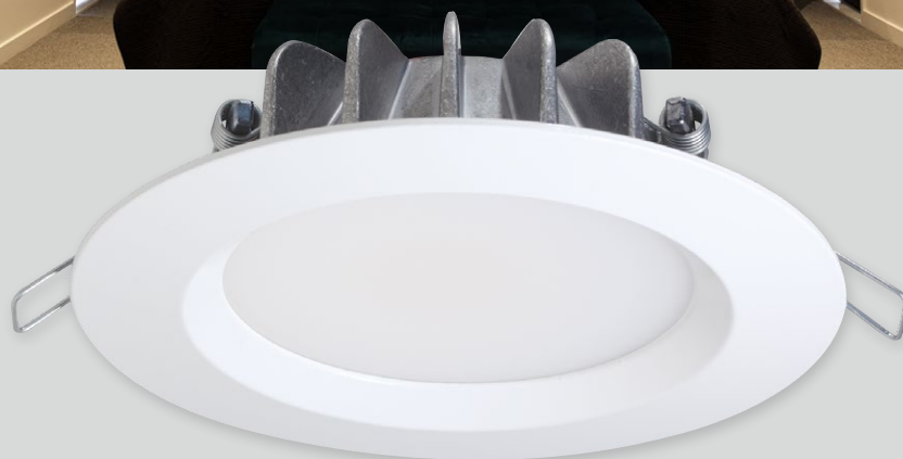
SL40 | SL40LP | SL40SD Opaque diffuser Beam 110° Wide angle lighting