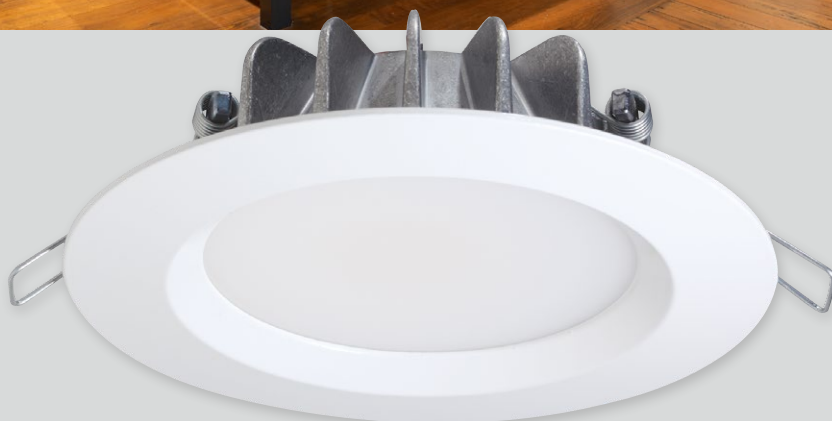
SL40 | SL40LP | SL40SD Opaque diffuser Beam 110°