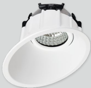
SLDL152T ULG clear glass Beam 20° 40° 60° Task | General lighting