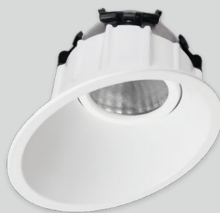
SLDL151T Prismatic diffuser Beam 20° 40° 60° General | Task lighting