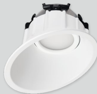
SLDL153T Opaque diffuser Beam 90° Wide angle lighting