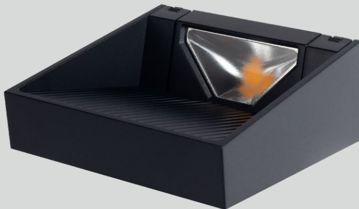
SLCW100F Textured Black