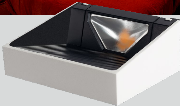
SLCW100F Textured White