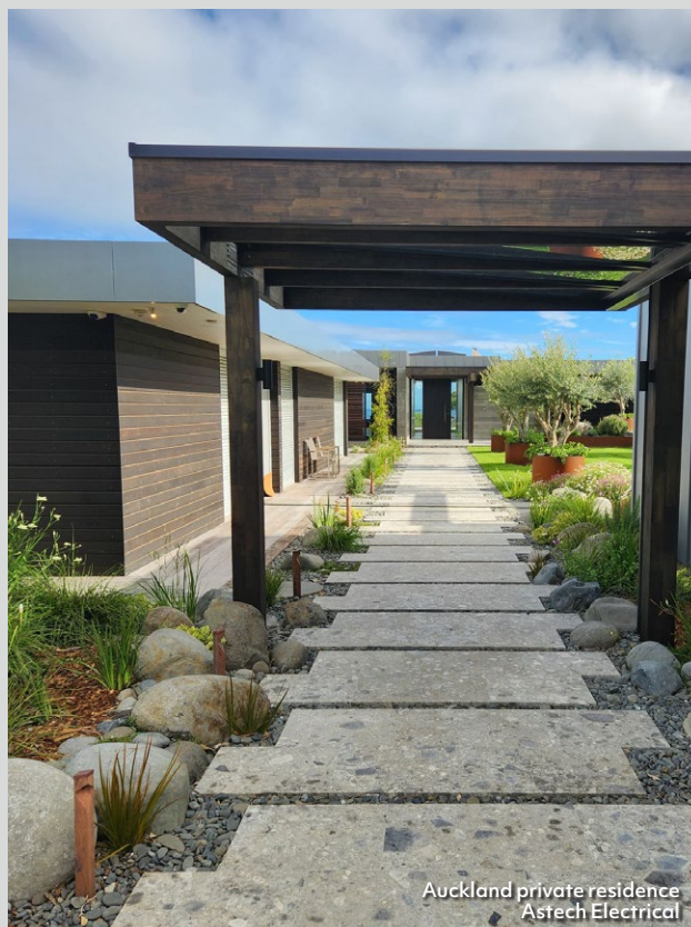
Auckland private residence Astech Electrical